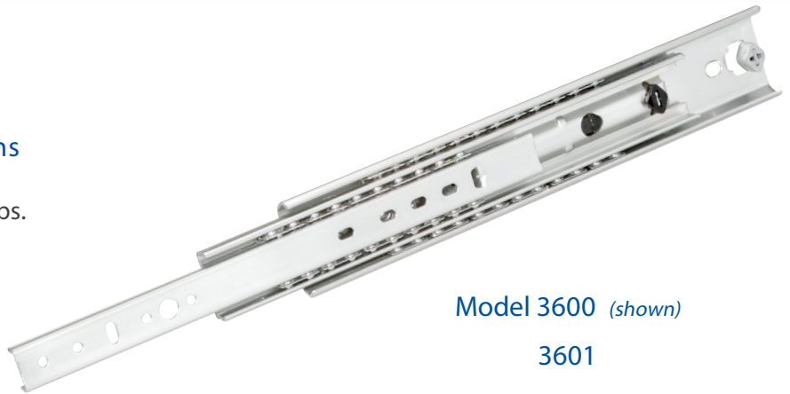
Model 3600 (shown)