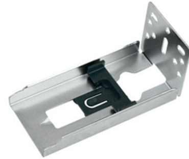
Rear Bracket P/N 4180-0752-XE

*Fits all models except 3832ETR, 3832EHDTR and 3832EC