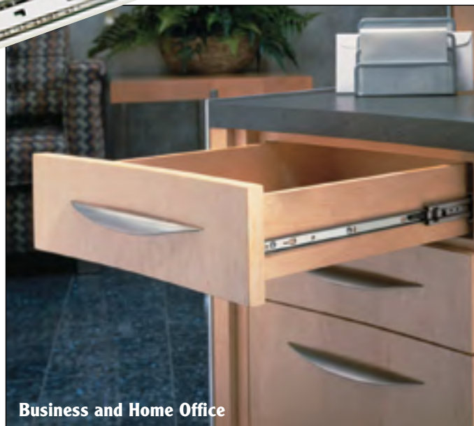
Business and Home Office