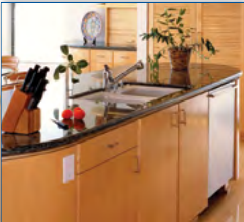
Light-duty residential applications