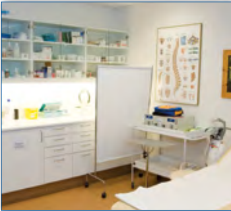
Medical cabinets or carts